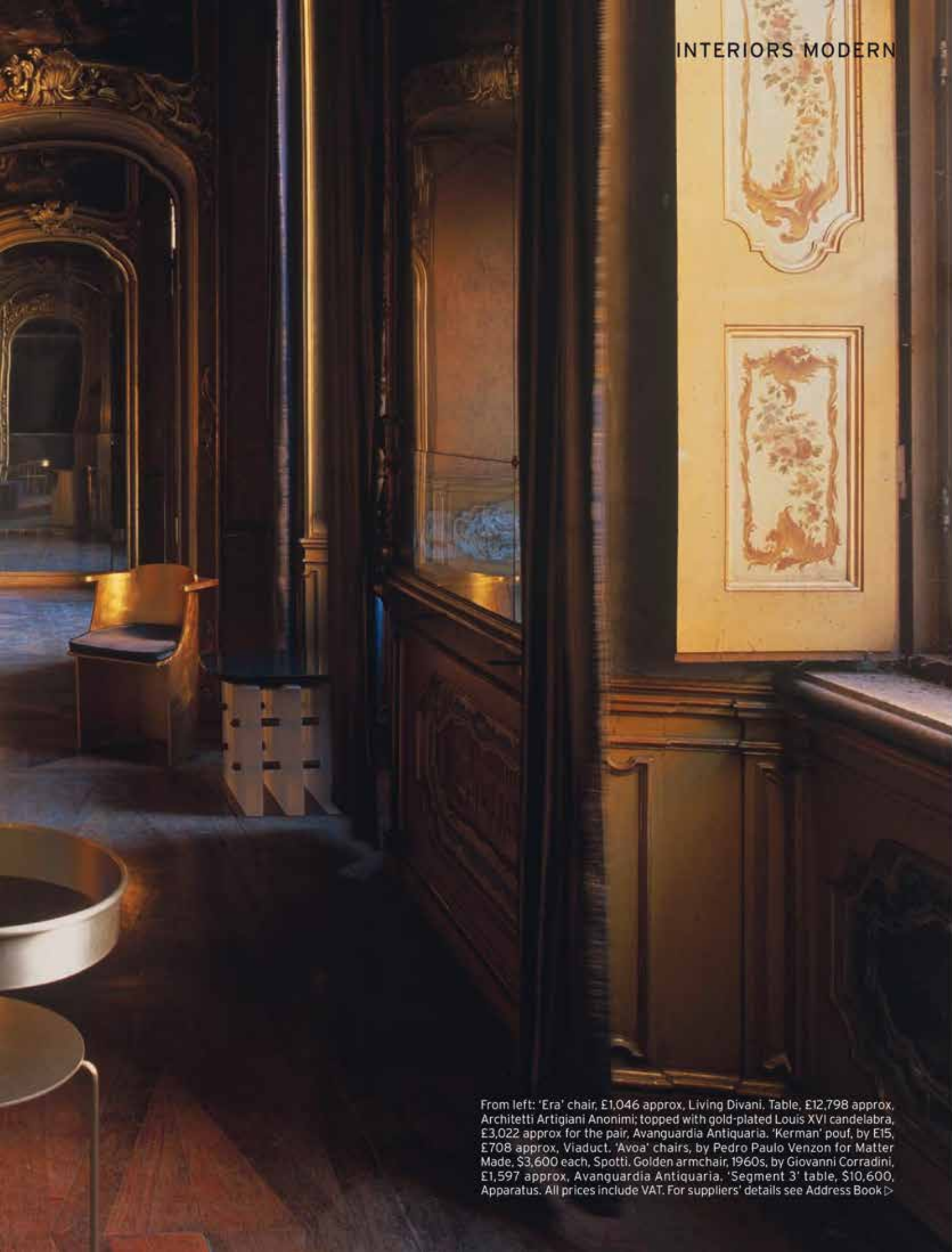
From left: 'Era' chair, £1,046 approx, Living Divani. Table, £12,798 approx, Architetti Artigiani Anonimi; topped with gold-plated Louis XVI candelabra, £3,022 approx for the pair, Avanguardia Antiquaria. 'Kerman' pouf, by E15, £708 approx, Viaduct. 'Avoa' chairs, by Pedro Paulo Venzon for Matter Made, $3,600 each, Spotti. Golden armchair, 1960s, by Giovanni Corradini, £1,597 approx, Avanguardia Antiquaria. 'Segment 3' table, $10,600, Apparatus. All prices include VAT. For suppliers' details see Address Book >